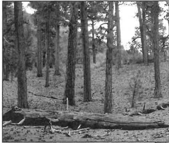
Figure 4. Downed logs can remain on the forest floor for many decades, providing clues about old forest patterns.