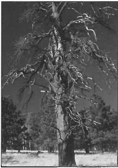
Figure 3. Like a living tree, this snag records growth forms that shows how it grew.