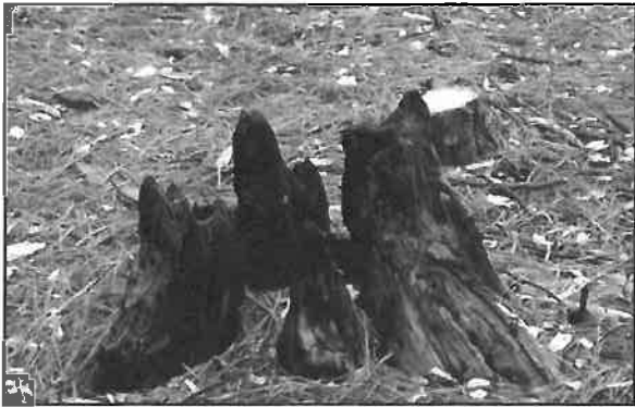
Figure 5. Stumps record the locations of now-vanished trees, and their growth rings can provide data similar to those of standing trees.