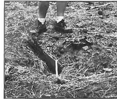
Figure 6. Holes where stumps burned or decayed can persist for many years.

with dendrochronological dating of tree rings (see below). Even without that level of detail, modern-day observers of forest conditions can reconstruct a number of important aspects of historic forest structure, including tree density and size and to what extent trees grew in clumps.