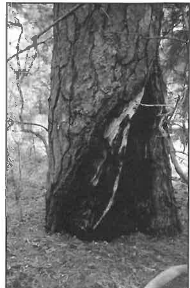
Figure 2. “Catfaces” such as this preserve records of past fires.