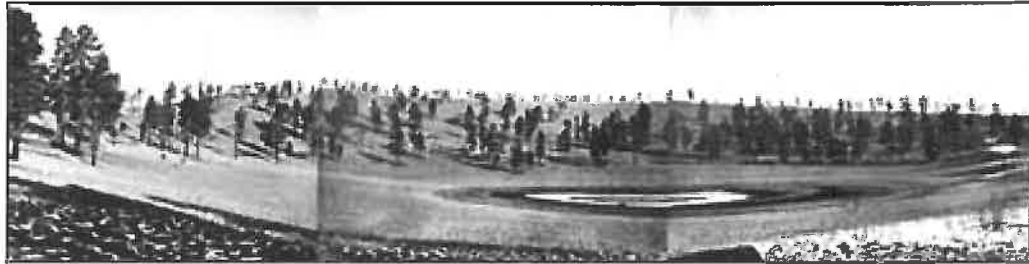
Figure 8. Photographs of the same forest stand before and after it was changed by modern land-management practices can help quantify changes over time, and can aid in setting restoration goals. Walker Lake, Coconino National Forest, Arizona, in the 1870s and 2003; 2003 photo courtesy of Dennis Lund and Neil Weintraub.