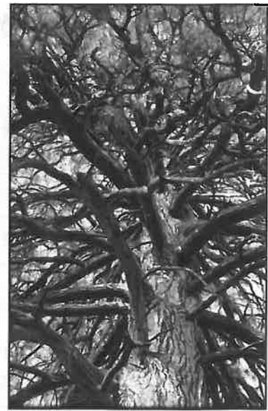
Figure 1. The thick, horizontal limbs of this old pine show that it grew in the open.

Snags. Dead trees can stand for many years in the Southwest, particularly if they are large (Figure 3). They provide important wildlife habitat for such species as bats and cavity-nesting birds. Their size, age, and growth form provide the same sorts of clues to forest structure as living trees.